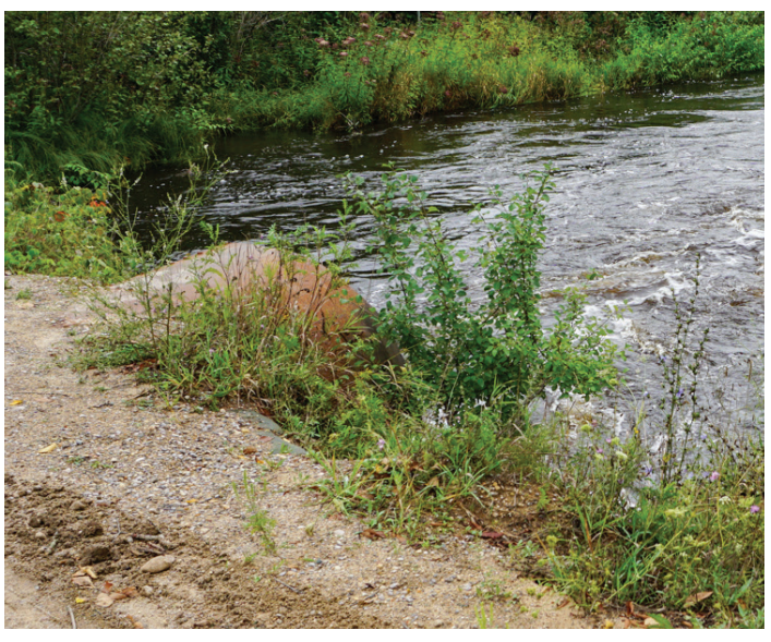
A narrow culvert in need of replacement on Fuller Road.

A massive restoration effort is currently underway to replace three crossings over the Jordan River and Deer Creek with full-channel timber bridges. The crossings are located at Jordan River Road East and West over the Jordan River and Fuller Road over Deer Creek. With the design phase completed, we are working with strong community and agency partners on a robust fundraising campaign to ensure construction will begin in 2023. The goal is to bundle the three crossings together under one project for maximum efficiency. The Jordan River is Lake Charlevoix's largest tributary; this crucial restoration work will have a significant impact on the entire Great Lakes region.