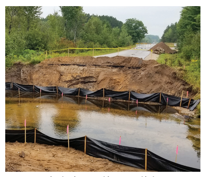
Construction begins on Robinson Road in late August with a Full-Channel timber Bridge coming soon.