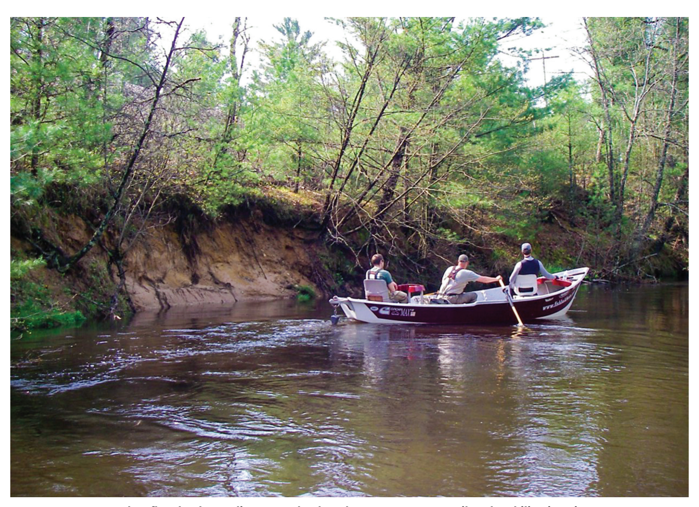
Anglers float by the eroding streambank at the Pere Marquette Railroad Stabilization Site.

The Pere Marquette railroad stabilization project continues to be a high priority for CRA. We continue to work with the landowners, community and agency partners to move the project forward. The final engineered design includes placing natural fieldstone along the toe, planting shrubs on the bank and throughout the rock, and excavating a larger bankfull bench on the opposite side of the river to match the reference reach stream dimensions. This restoration project is crucial for the future of the Pere Marquette to ensure it remains a beloved gem.